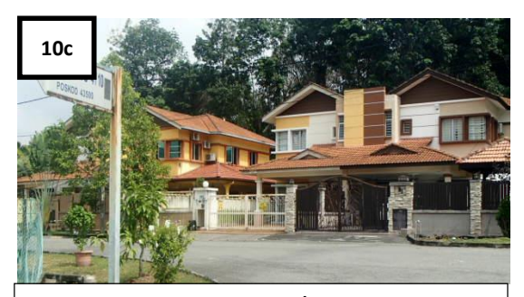
JALAN TTS 4/10 GOOGLE MAP COORDINATE