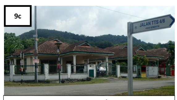
JALAN TTS 4/6 GOOGLE MAP COORDINATE