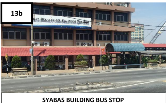
SYABAS BUILDING BUS STOP GOOGLE MAP COORDINATE

Latitude: 2.983746; Longitude: 101.81511