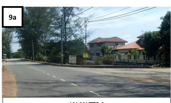
JALAN TTS 4 GOOGLE MAP COORDINATE

Latitude: 2.948857; Longitude: 101.846545