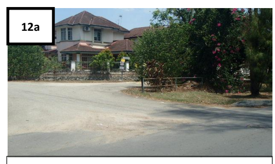
JALAN TTS 5 GOOGLE MAP COORDINATE

Latitude: 2.954148; Longitude: 101.877809