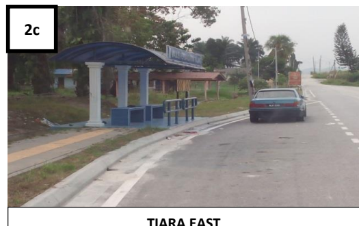
TIARA EAST GOOGLE MAP COORDINATE

Latitude: 2.943677 ; Longitude: 101.875867