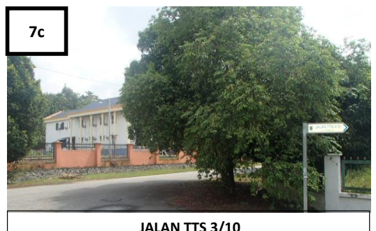
JALAN TTS 3/10 GOOGLE MAP COORDINATE