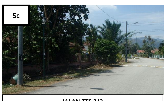
JALAN TTS 3/2 GOOGLE MAP COORDINATE