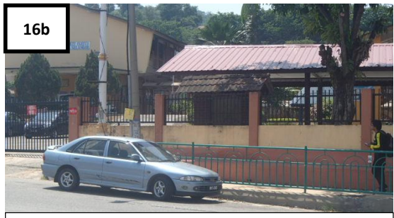
KAJANG KTM STATION GOOGLE MAP COORDINATE

\textbf{Latitude:}\ 2.991351\ \textbf{;}\ \textbf{Longitude:}\ 101.791562