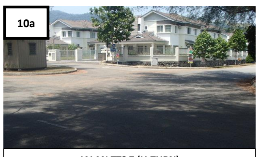
JALAN TTS 7 (U-TURN) GOOGLE MAP COORDINATE

Latitude: 2.954148; Longitude: 101.877809