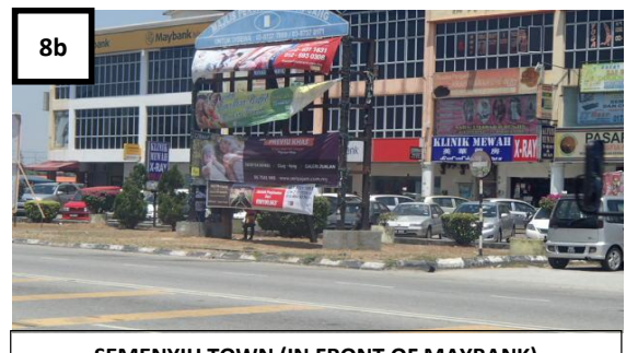
SEMENYIH TOWN (IN FRONT OF MAYBANK) GOOGLE COORDINATE MAP