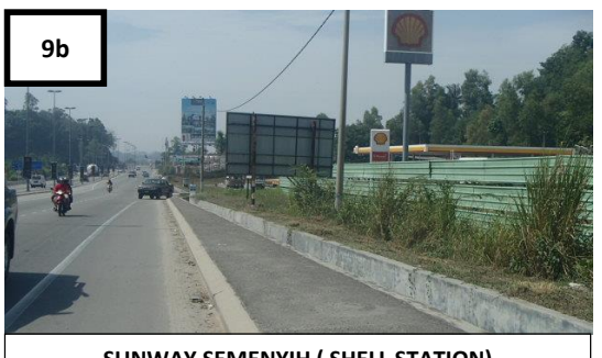
SUNWAY SEMENYIH ( SHELL STATION) GOOGLE COORDINATE MAP

\textbf{Latitude:}\ 2.962711\ \textbf{;}\ \textbf{Longitude:}\ 101.836664