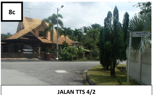
JALAN TTS 4/2 GOOGLE MAP COORDINATE