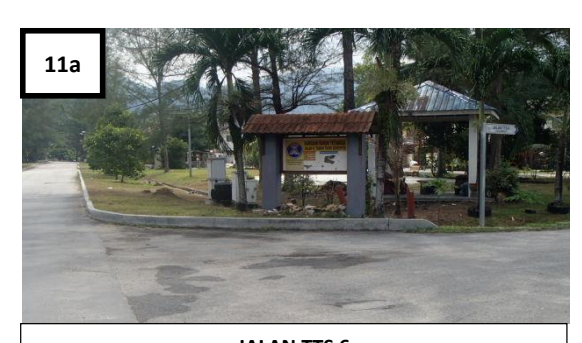
JALAN TTS 6 GOOGLE MAP COORDINATE

Latitude: 2.951804; Longitude: 101.875684