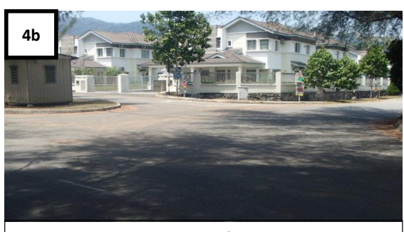
JALAN TTS 7 GOOGLE MAP COORDINATE