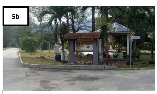
JALAN TTS 6 GOOGLE MAP COORDINATE