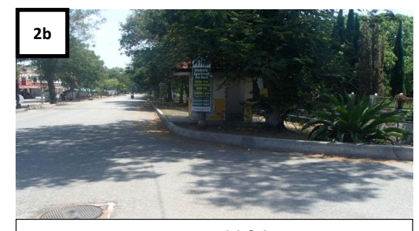
JALAN TTS 2 & 3 GOOGLE MAP COORDINATE