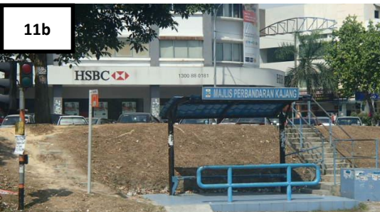
11b HSBC KAJANG PRIMA BUS STOP GOOGLE MAP COORDINATE Latitude: 2.983746 ; Longitude: 101.81511