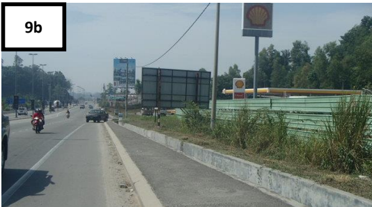
9b SUNWAY SEMENYIH ( SHELL STATION) GOOGLE COORDINATE MAP Latitude: 2.962711 ; Longitude: 101.836664