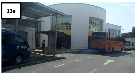
SA BUILDING GOOGLE MAP COORDINATE Latitude: 2.943677 ; Longitude: 101.875867