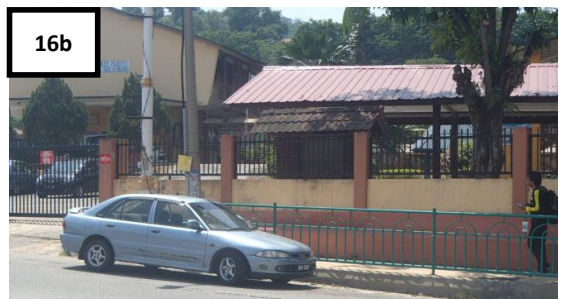
16b KAJANG KTM STATION GOOGLE MAP COORDINATE Latitude: 2.985568 ; Longitude: 101.791313