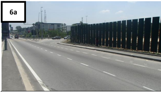
SUNWAY SEMENYIH (MAIN ROAD – 50 METRES ON THE LEFT SIDE FROM TRAFFIC LIGHT JUNCTION ) GOOGLE MAP COORDINATE Latitude: 2.960469 ; Longitude: 101.838617