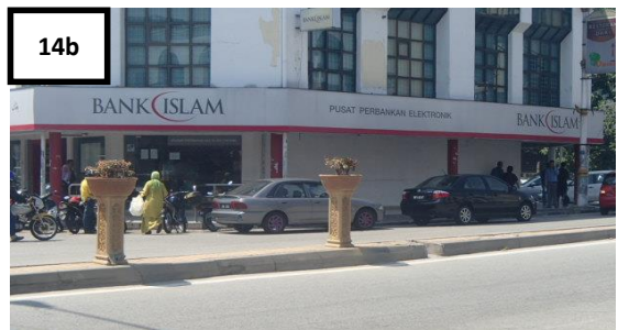
14b BANK ISLAM KAJANG GOOGLE MAP COORDINATE Latitude: 2.991351 ; Longitude: 101.791562