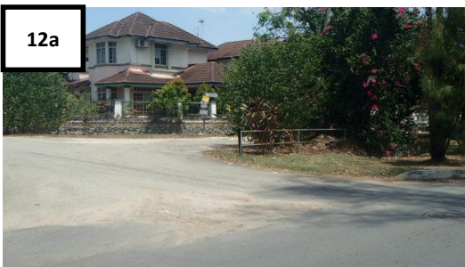
JALAN TTS 5 GOOGLE MAP COORDINATE Latitude: 2.950728 ; Longitude: 101.874483