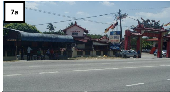
BUS STOP NEXT TO CHINESE TEMPLE GOOGLE MAP COORDINATE Latitude: 2.948857 ; Longitude: 101.846545