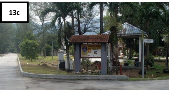
JALAN TTS 6 GOOGLE MAP COORDINATE Latitude: 2.951804 ; Longitude: 101.875684