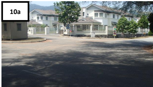
JALAN TTS 7 (U-TURN) GOOGLE MAP COORDINATE Latitude: 2.954148 ; Longitude: 101.877809