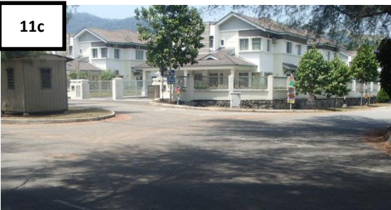
JALAN TTS 7 GOOGLE MAP COORDINATE Latitude: 2.954148 ; Longitude: 101.877809