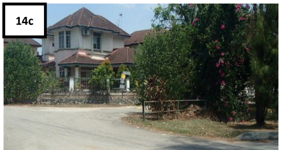
JALAN TTS 5 GOOGLE MAP COORDINATE Latitude: 2.950728 ; Longitude: 101.874483