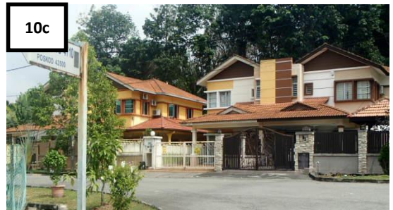
JALAN TTS 4/10 GOOGLE MAP COORDINATE