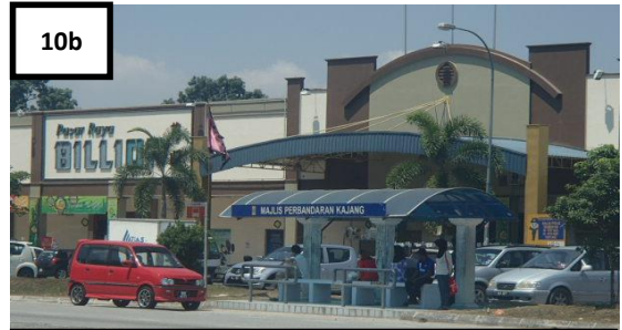
10b BILLION ( BUS STOP INFRONT OF BILLION ) GOOGLE MAP COORDINATE Latitude: 2.973365 ; Longitude: 101.830861