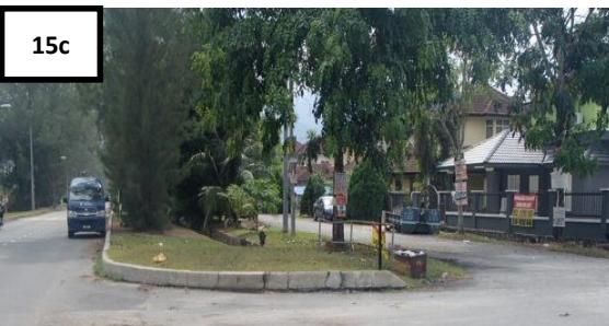
JALAN TTS 5/2 GOOGLE MAP COORDINATE Latitude: 2.949308 ; Longitude: 101.87282