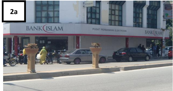
2a BANK ISLAM KAJANG GOOGLE MAP COORDINATE Latitude: 2.991351 ; Longitude: 101.791562