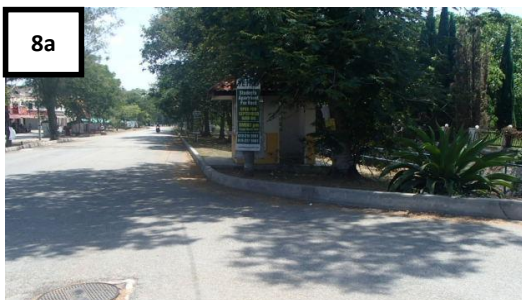
JALAN TTS 2 & 3 GOOGLE MAP COORDINATE