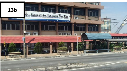
13b SYABAS BUILDING BUS STOP GOOGLE MAP COORDINATE Latitude: 2.992601 ; Longitude: 101.792236