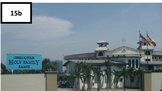
15b OPPOSITE HOLY FAMILY CHURCH (Only 5:15pm Sat/ 8:00 am on Sun) GOOGLE MAP COORDINATE