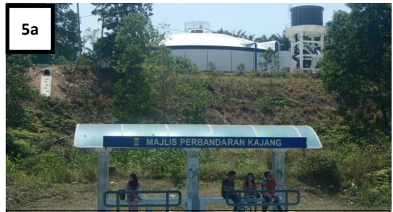
5a BILLION ( BUS STOP OPPOSITE BILLION ) GOOGLE MAP COORDINATE