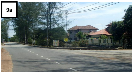
JALAN TTS 4 GOOGLE MAP COORDINATE