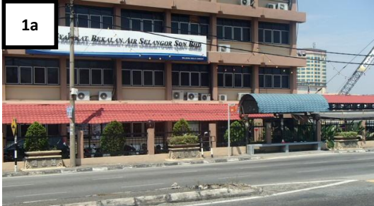
1a SYABAS BUILDING BUS STOP GOOGLE MAP COORDINATE Latitude: 2.992601 ; Longitude: 101.792236

* 15 minutes before KTM bus scheduled time