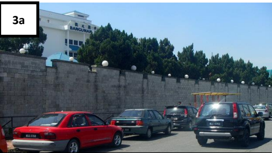
3a NEW ERA COLLEGE GOOGLE MAP COORDINATE