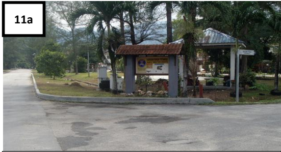
JALAN TTS 6 GOOGLE MAP COORDINATE Latitude: 2.951804 ; Longitude: 101.875684