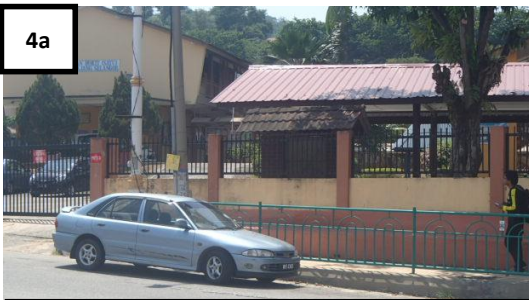
4a KAJANG KTM STATION GOOGLE MAP COORDINATE