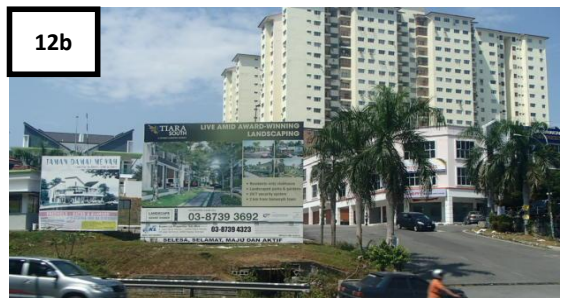
12b PANGSAPURI DAMAI MEWAH GOOGLE MAP COORDINATE Latitude: 2.985398 ; Longitude: 101.812835