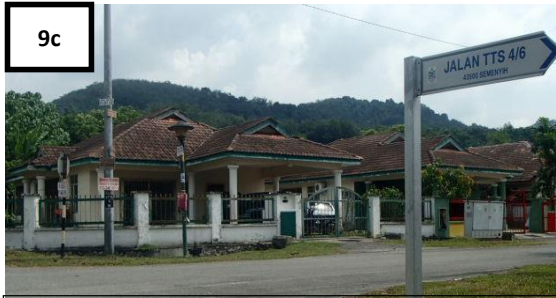
JALAN TTS 4/6 GOOGLE MAP COORDINATE