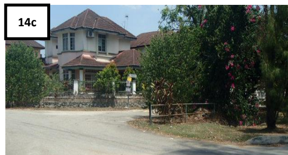
JALAN TTS 5 GOOGLE MAP COORDINATE