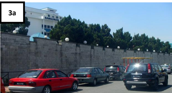
3a NEW ERA COLLEGE GOOGLE MAP COORDINATE