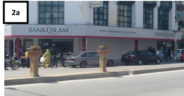
2a BANK ISLAM KAJANG GOOGLE MAP COORDINATE