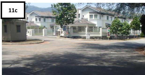
JALAN TTS 7 GOOGLE MAP COORDINATE