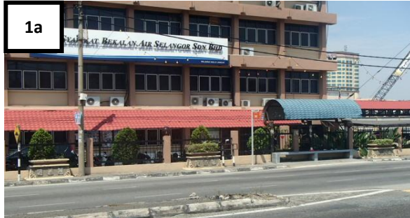
1a SYABAS BUILDING BUS STOP GOOGLE MAP COORDINATE Latitude: 2.992601 ; Longitude: 101.792236

* 15 minutes before KTM bus scheduled time