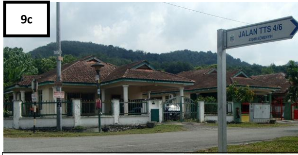
JALAN TTS 4/6 GOOGLE MAP COORDINATE