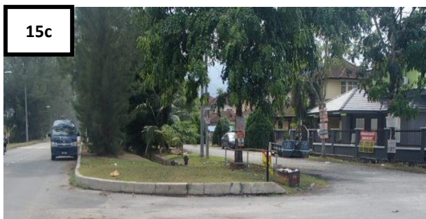
JALAN TTS 5/2 GOOGLE MAP COORDINATE Latitude: 2.949308 ; Longitude: 101.87282