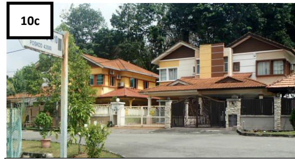
JALAN TTS 4/10 GOOGLE MAP COORDINATE