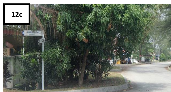
JALAN TTS 6/10 GOOGLE MAP COORDINATE