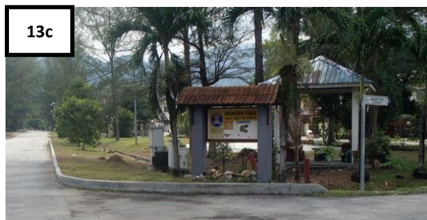
JALAN TTS 6 GOOGLE MAP COORDINATE Latitude: 2.951804 ; Longitude: 101.875684