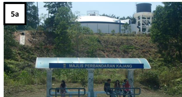
5a BILLION ( BUS STOP OPPOSITE BILLION ) GOOGLE MAP COORDINATE