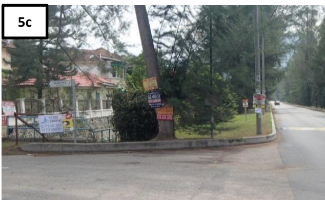
JALAN TTS 2 & 3 GOOGLE MAP COORDINATE Latitude: 2.947122 ; Longitude: 101.866297