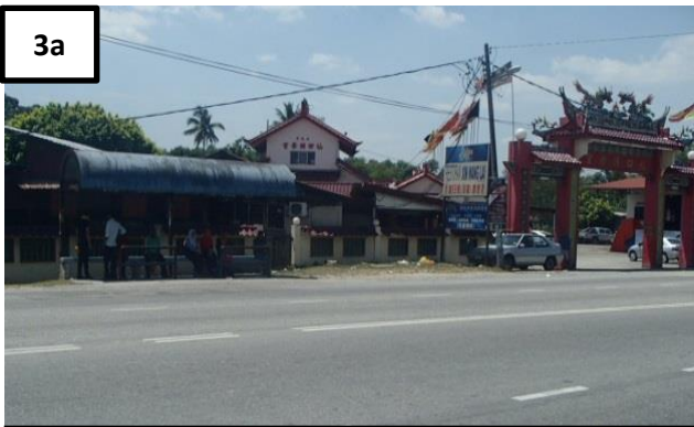
3a BUS STOP NEXT TO CHINESE TEMPLE GOOGLE MAP COORDINATE Latitude: 2.948857 ; Longitude: 101.846545