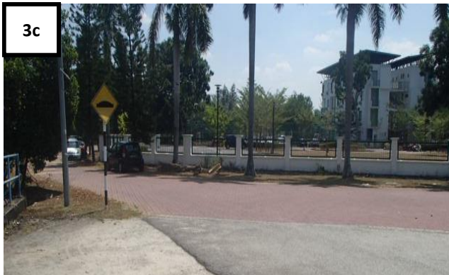
TIARA EAST GOOGLE MAP COORDINATE Latitude: 2.948028 ; Longitude: 101.853125