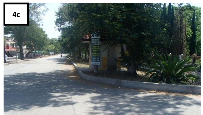
TETRIS APARTMENT GOOGLE MAP COORDINATE Latitude: 2.946785 ; Longitude: 101.862032