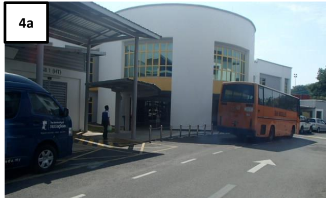
4a SA BUILDING GOOGLE MAP COORDINATE Latitude: 2.943677 ; Longitude: 101.875867