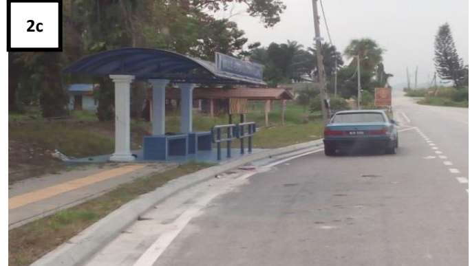
SA BUILDING GOOGLE MAP COORDINATE Latitude: 2.943677 ; Longitude: 101.875867