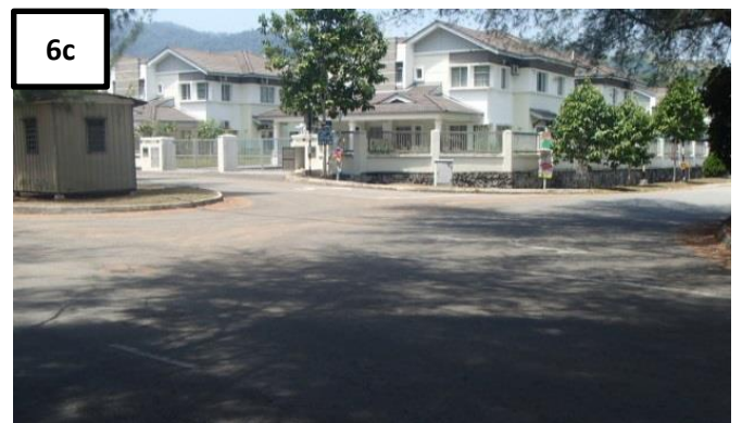
JALAN TTS 4 GOOGLE MAP COORDINATE Latitude: 2.949533 ; Longitude: 101.872852