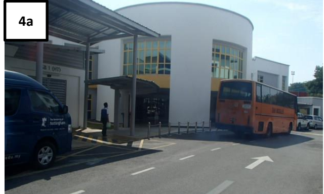
4a SA BUILDING GOOGLE MAP COORDINATE Latitude: 2.943677 ; Longitude: 101.875867