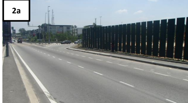
2a SUNWAY SEMENYIH (MAIN ROAD – 50 METRES ON THE LEFT SIDE FROM TRAFFIC LIGHT JUNCTION ) GOOGLE MAP COORDINATE