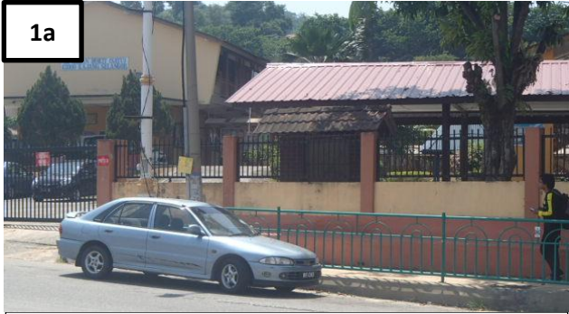
1a KAJANG KTM STATION GOOGLE MAP COORDINATE Latitude: 2.985568 ; Longitude: 101.791313