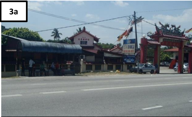
3a BUS STOP NEXT TO CHINESE TEMPLE GOOGLE MAP COORDINATE Latitude: 2.948857 ; Longitude: 101.846545