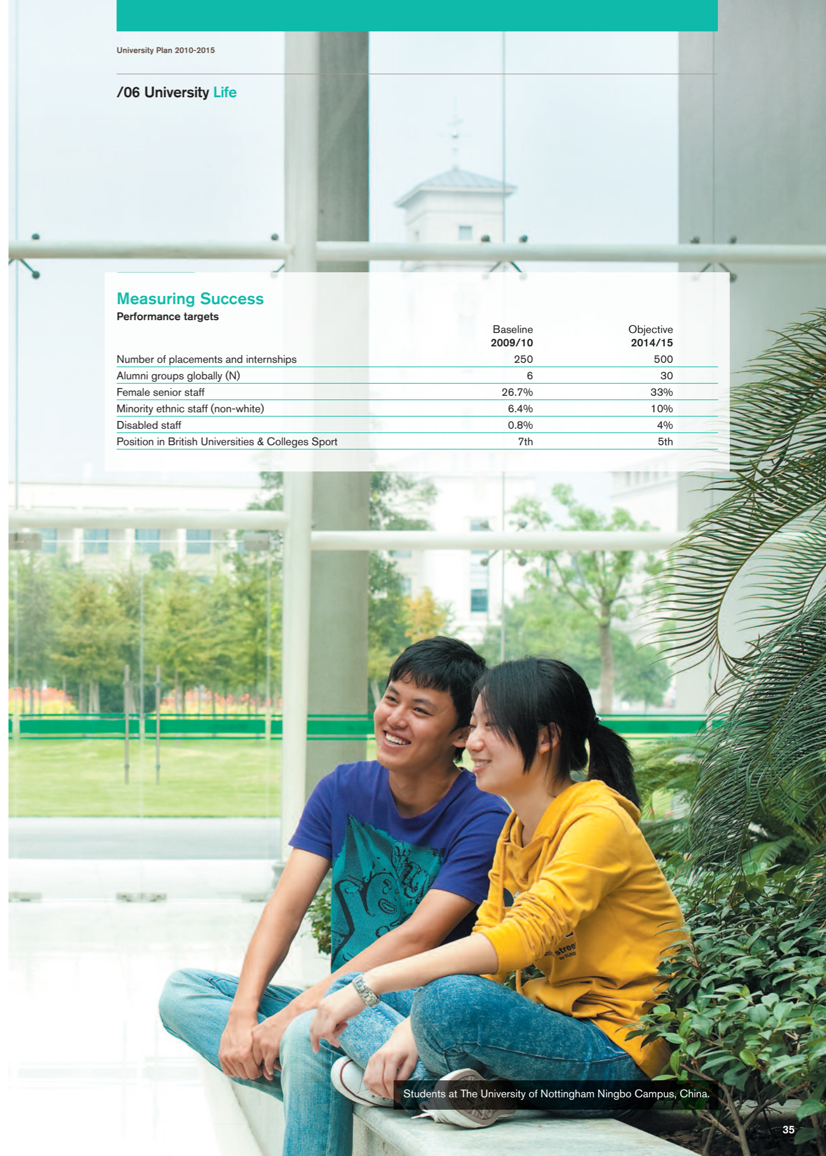
Students at The University of Nottingham Ningbo Campus, China.