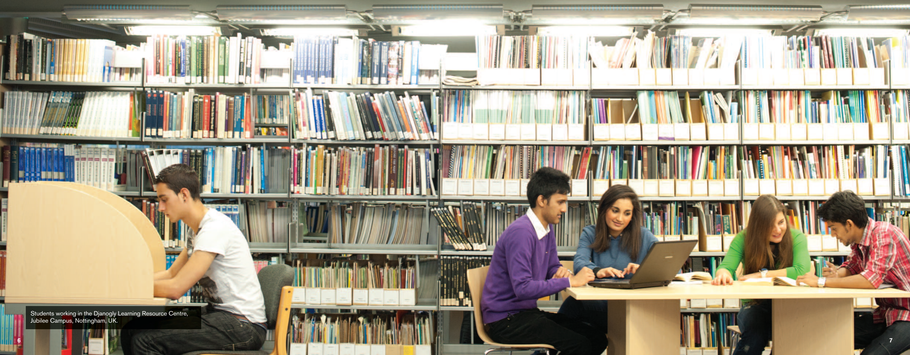
Students working in the Djanogly Learning Resource Centre, Jubilee Campus, Nottingham, UK.