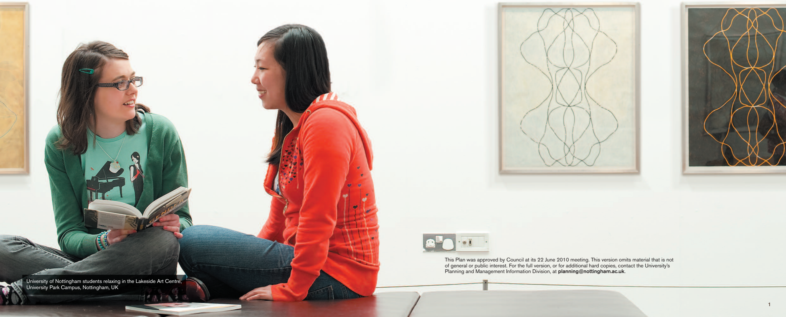
University of Nottingham students relaxing in the Lakeside Art Centre, University Park Campus, Nottingham, UK

This Plan was approved by Council at its 22 June 2010 meeting. This version omits material that is not of general or public interest. For the full version, or for additional hard copies, contact the University's Planning and Management Information Division, at planning@nottingham.ac.uk .