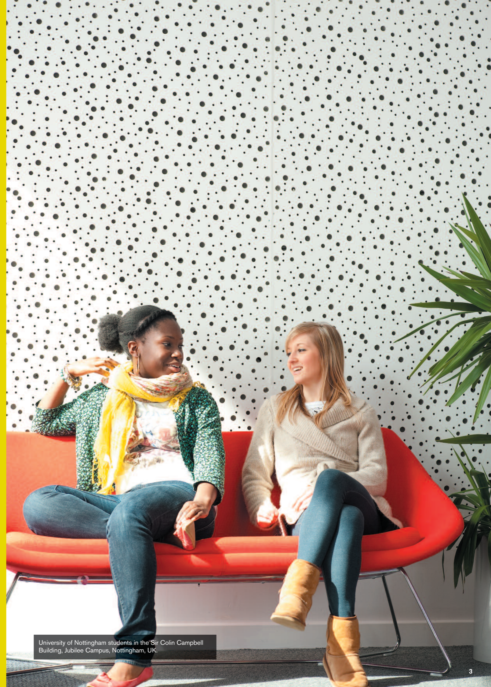
University of Nottingham students in the Sir Colin Campbell Building, Jubilee Campus, Nottingham, UK.