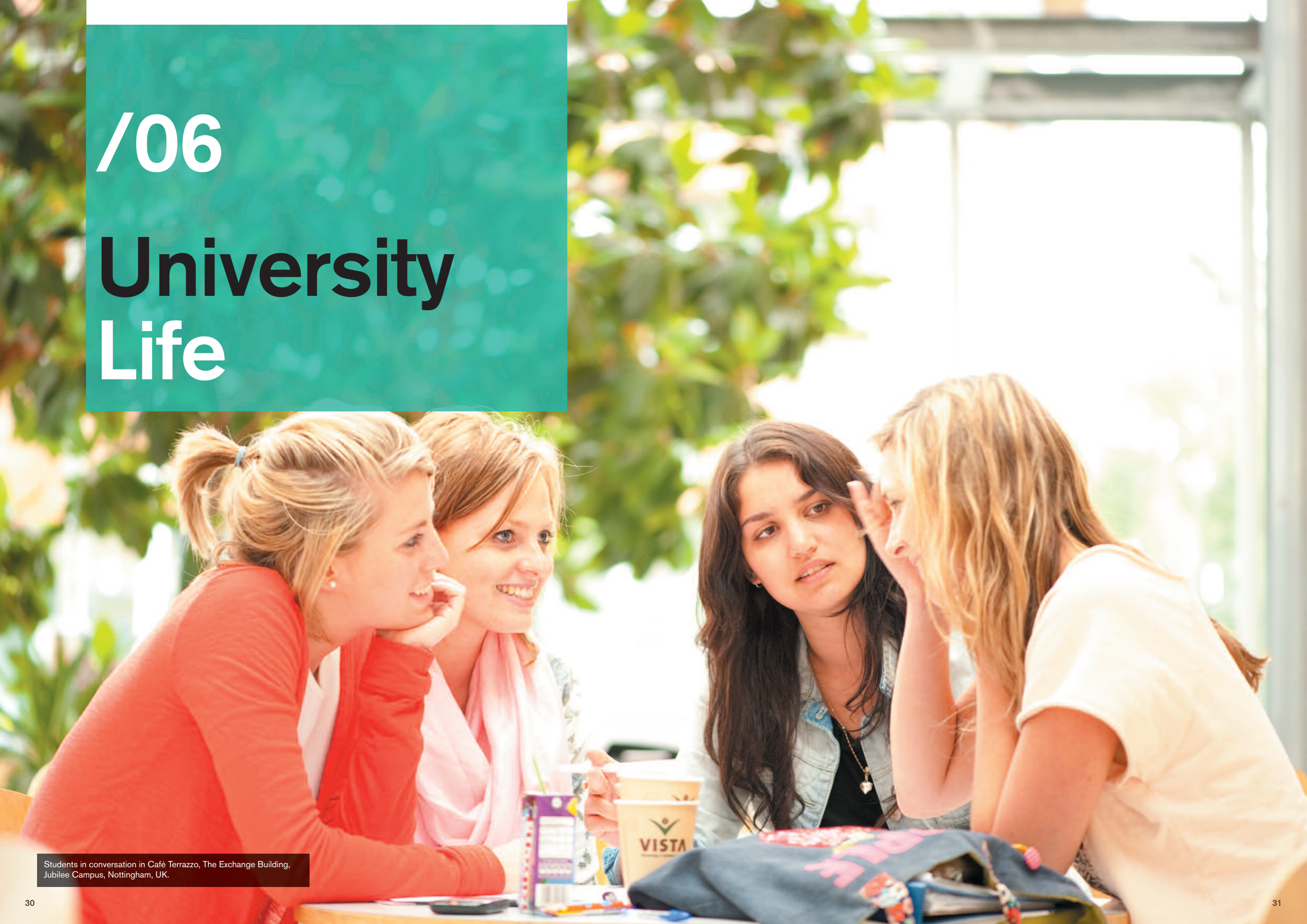
Students in conversation in Café Terrazzo, The Exchange Building, Jubilee Campus, Nottingham, UK.