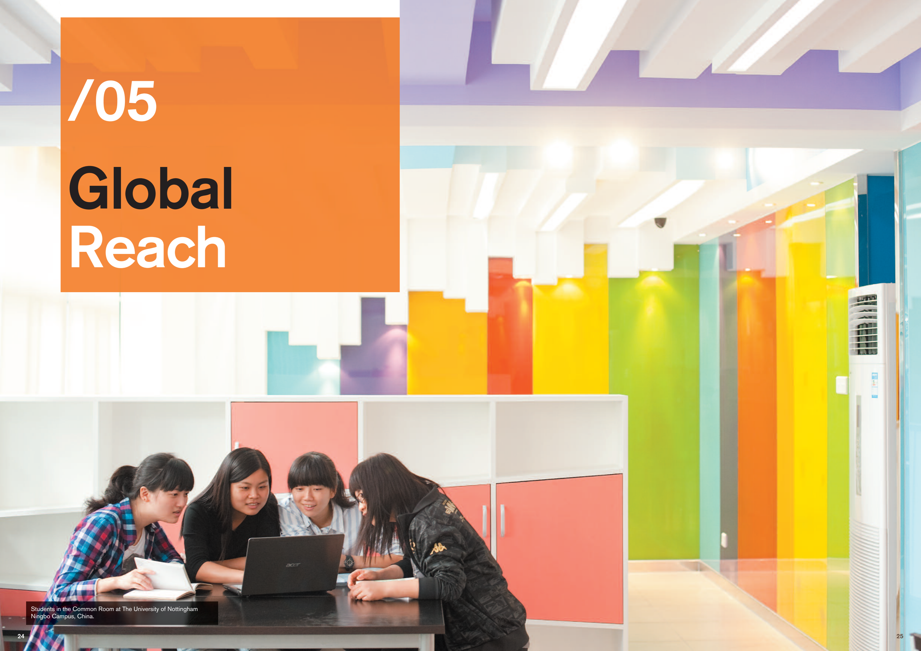
Students in the Common Room at The University of Nottingham Ningbo Campus, China.