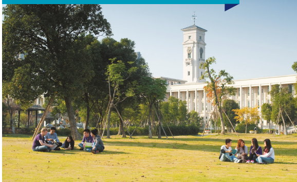
The University of Nottingham Malaysia.