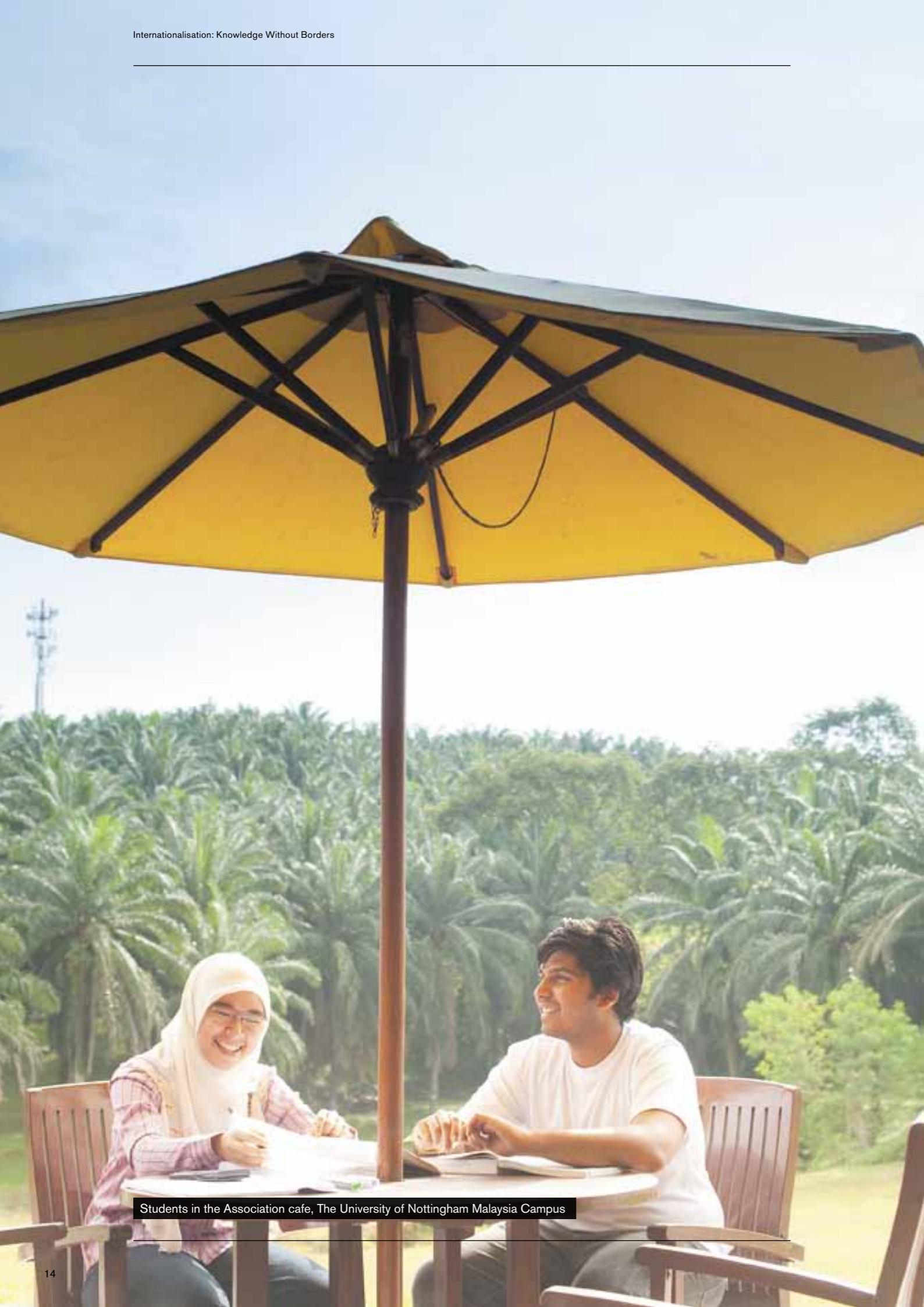
Students in the Association cafe, The University of Nottingham Malaysia Campus

With vital funding from the University's Cascade Fund a group of students travelled almost 8,000 miles to help the victims of Sri Lanka's civil war rebuild their lives and communities. Through their charity, Future for Jaffna (FFJ), the students helped widows set up their own businesses, enabling them to secure a sustainable income to provide for their families.