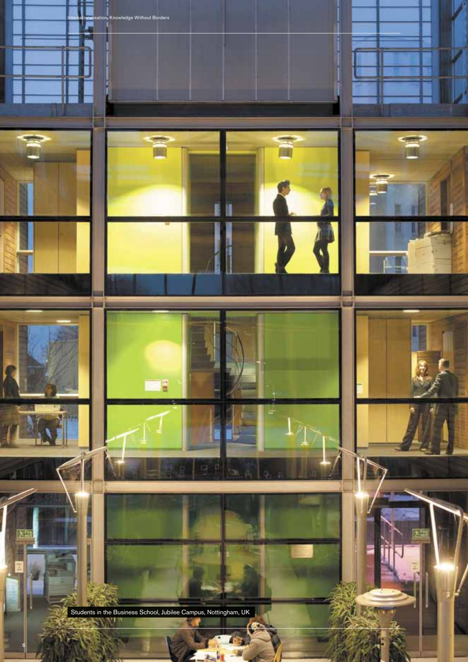
Students in the Business School, Jubilee Campus, Nottingham, UK