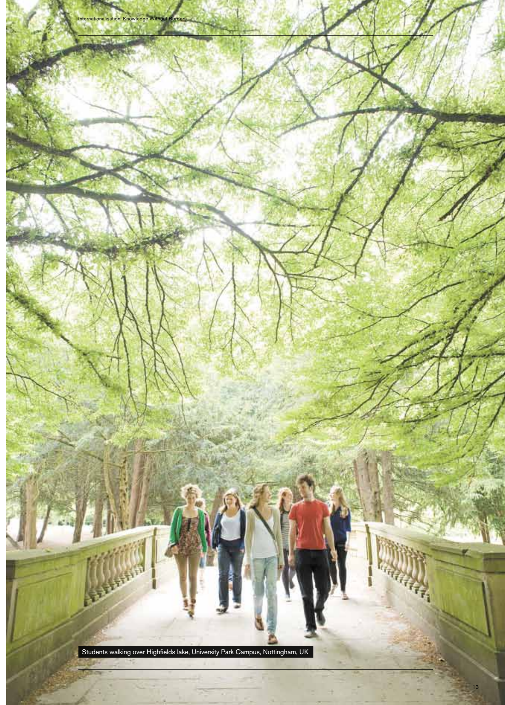
Students walking over Highfields lake, University Park Campus, Nottingham, UK

We offer a substantial package of support facilities and services to students. There is a specialised international team who help and advise international students on issues such as immigration, employment, finance, personal/family concerns and academic difficulties. Culture Vulture is an innovative programme which allows students from all over the world to meet, form friendships, share languages and share cultural events.