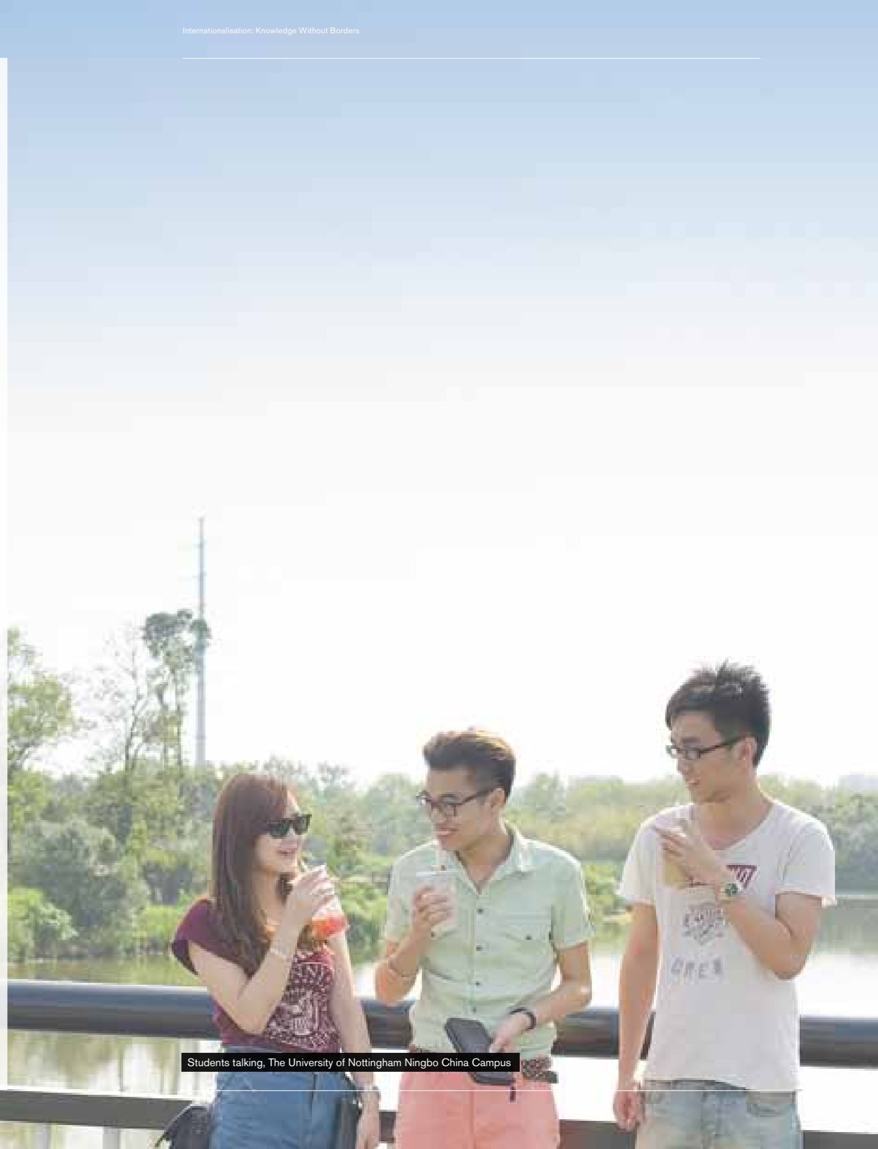
Students talking, The University of Nottingham Ningbo China Campus