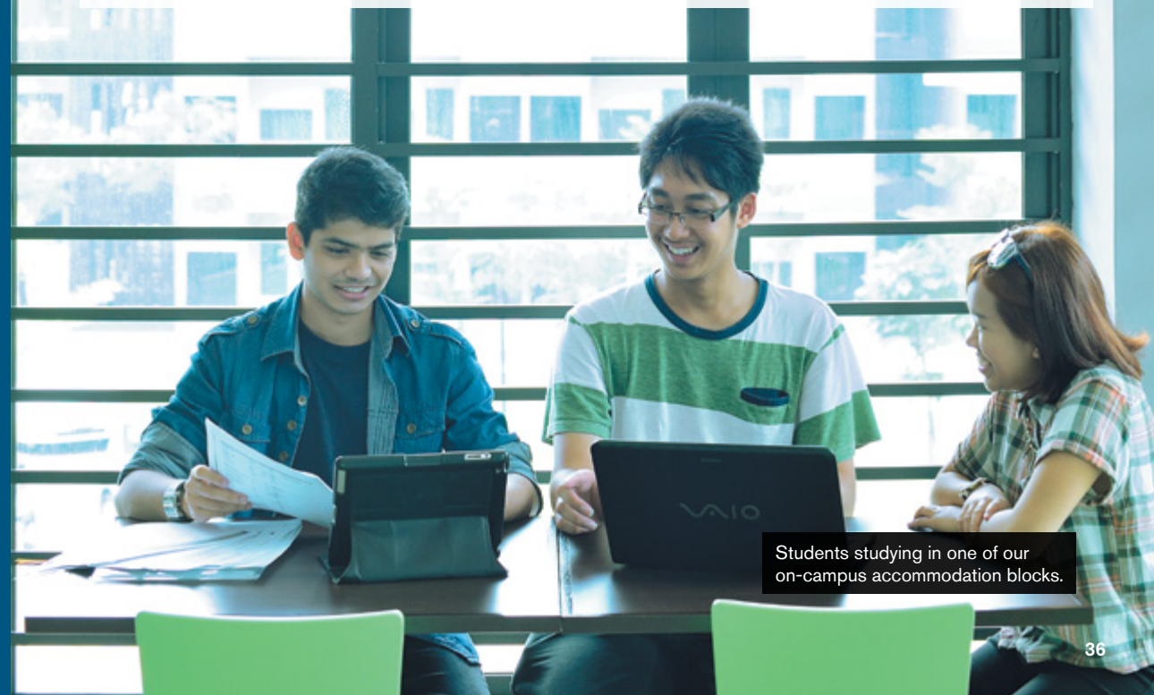
Students studying in one of our on-campus accommodation blocks.