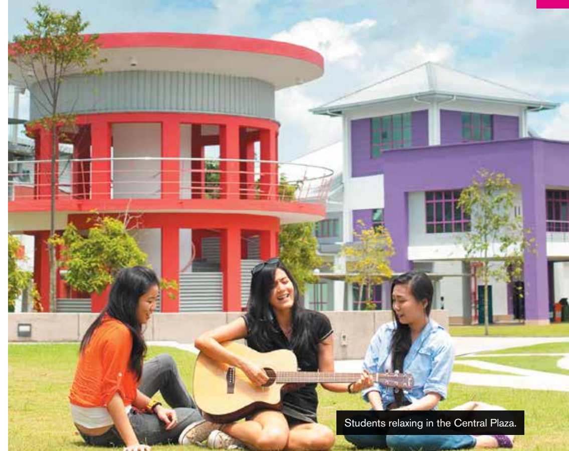
Students relaxing in the Central Plaza.

The halls on campus are just a few minutes' walk from the campus' academic and recreational facilities. To find out more about life in halls, please see page 39.