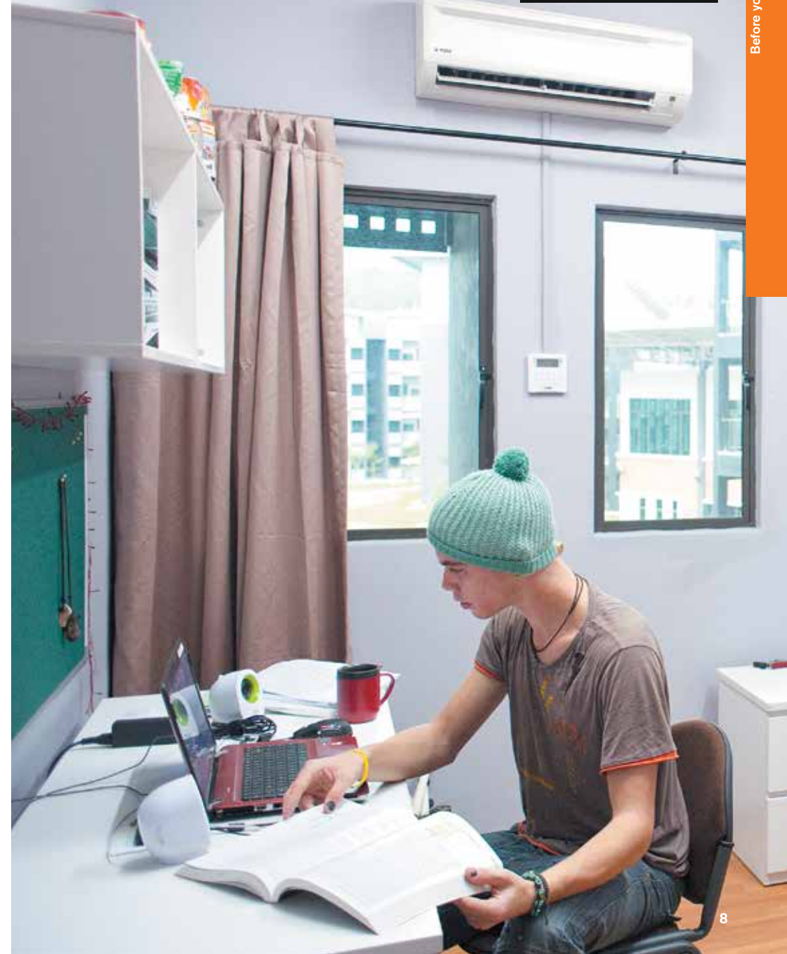
Student studying in his bedroom at Perhentian Hall

Before registration, you will receive information explaining when you need to arrive on campus. Normally, students are only allowed to check into on-campus accommodation one week before registration day. Malaysian students will only be allowed to check in during Accommodation Office working hours (Monday to Friday from 9am- 5.30pm). If you are an international student, please refer to the airport pick-up information which will be sent together with your visa approval letter.