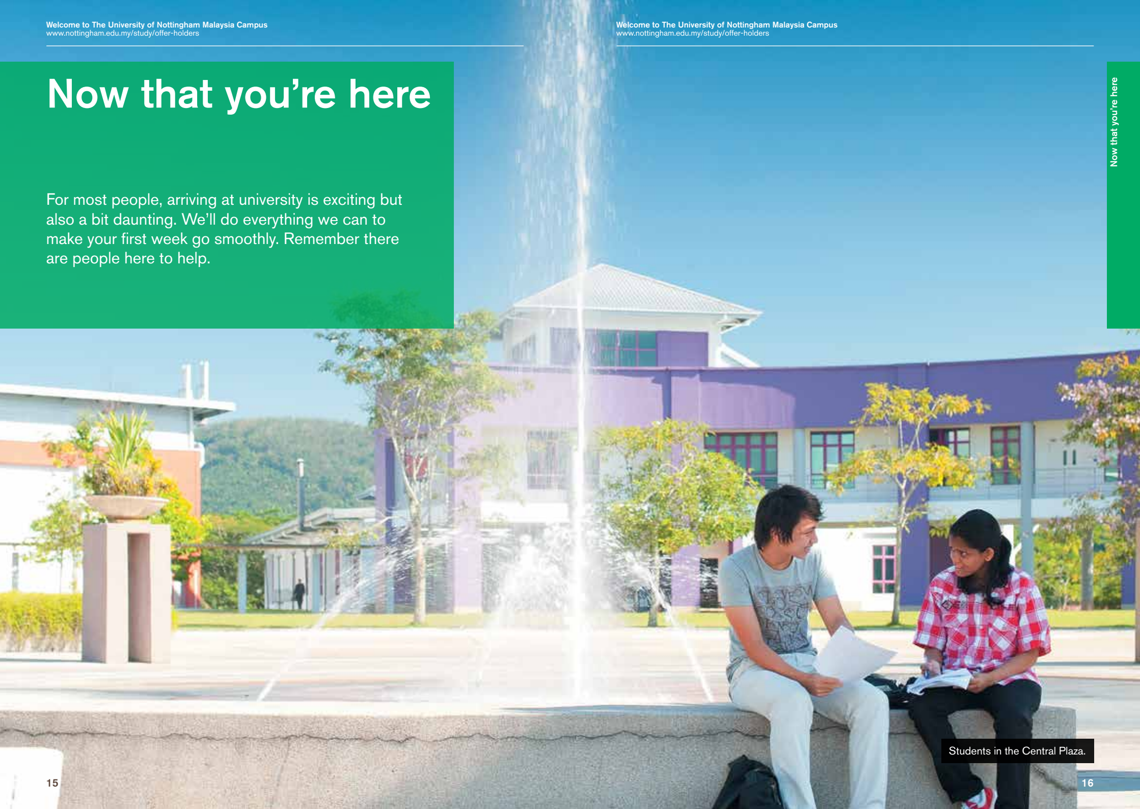
Students in the Central Plaza.