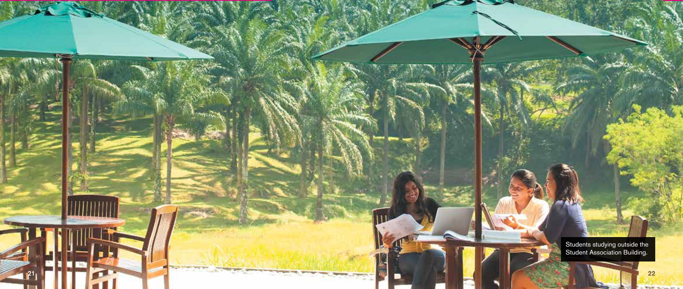
Students studying outside the Student Association Building.

Unpacked? Tick. Met your neighbours? Tick. Registered and sorted the other formalities? Tick. Once you've started to get your head around how things work, take some time to read about the inner workings of student life at Nottingham. This section will help you make the most of your time here. Enjoy!