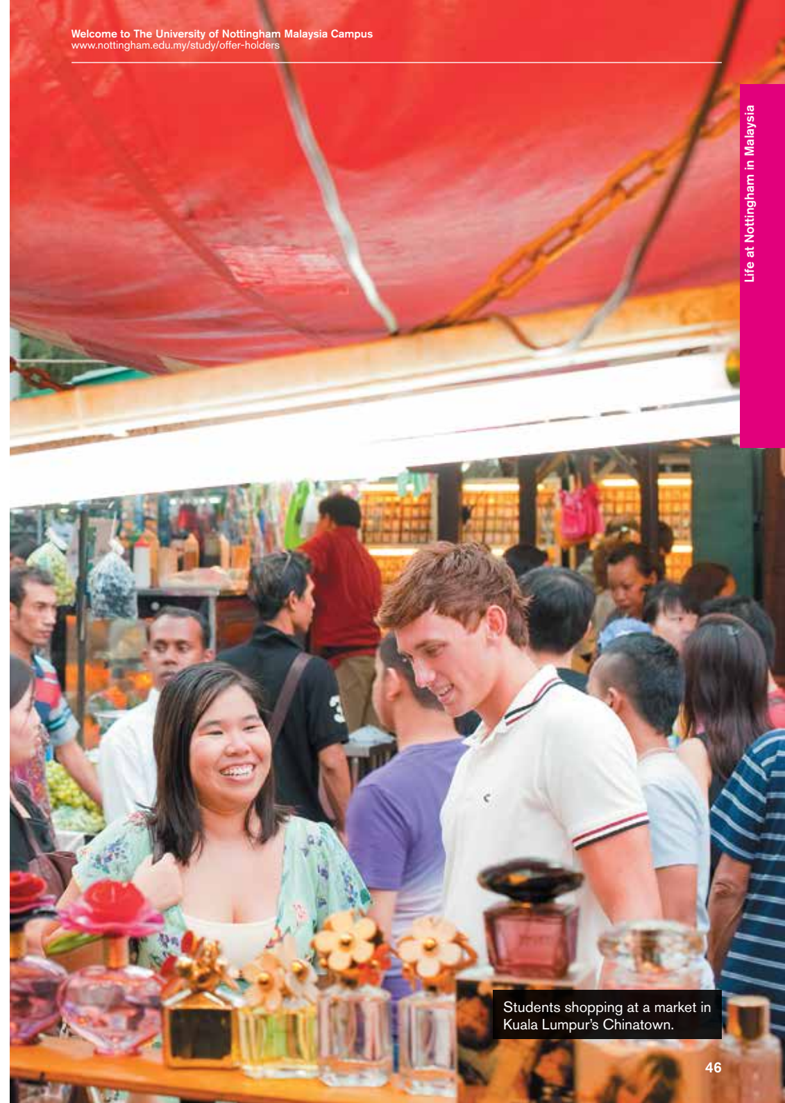
Students shopping at a market in Kuala Lumpur's Chinatown.

It is worthwhile purchasing a Touch 'n' Go card as it makes it convenient to pay for your public transport fares. Touch 'n' Go cards enable you to pay for LRT, KTM and Monorail fees by swiping your card at train and monorail stations. You can purchase and top up Touch 'n' Go cards at train and monorail stations and some petrol stations and convenience stores. Find out more at www.touchngo.com.my