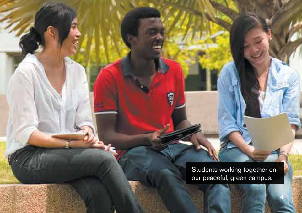
Students working together on our peaceful, green campus.

This guide contains practical information about living and studying at the Malaysia Campus. It will help you find your way around when you first arrive and will be a useful reference guide throughout your time here. Please take the time to read through the information and to familiarise yourself with the contents. It contains everything you need to know about your first few weeks. Please make sure you bring it with you.