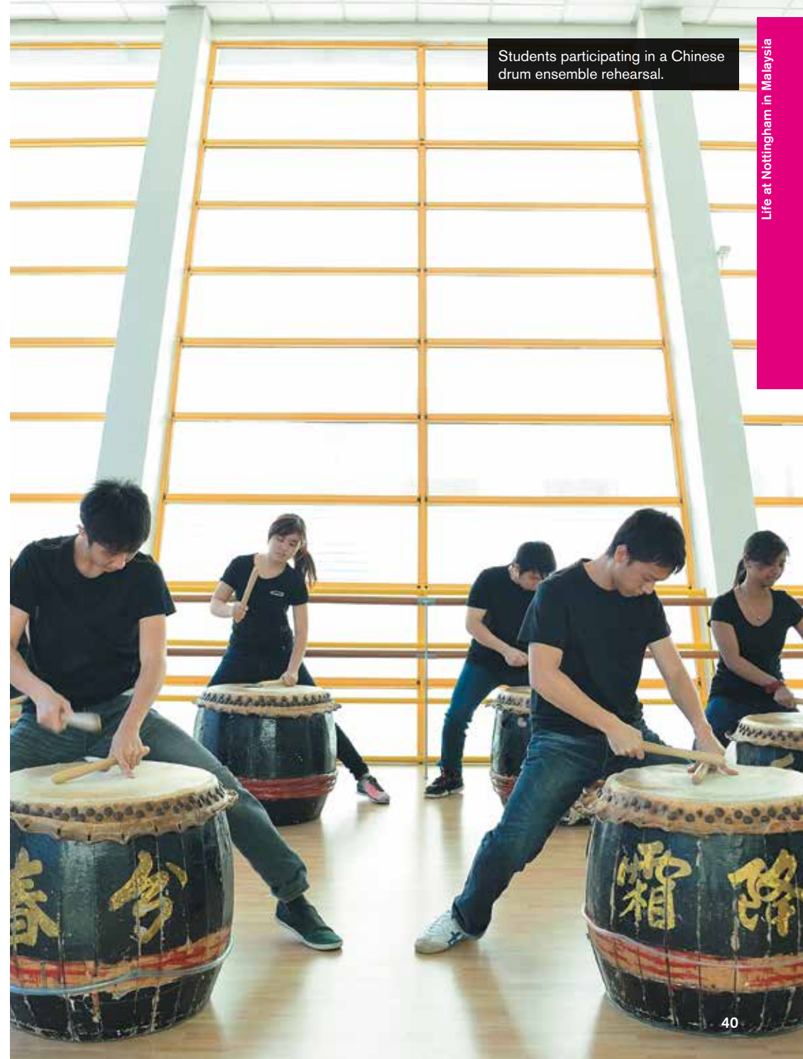
Students participating in a Chinese drum ensemble rehearsal.