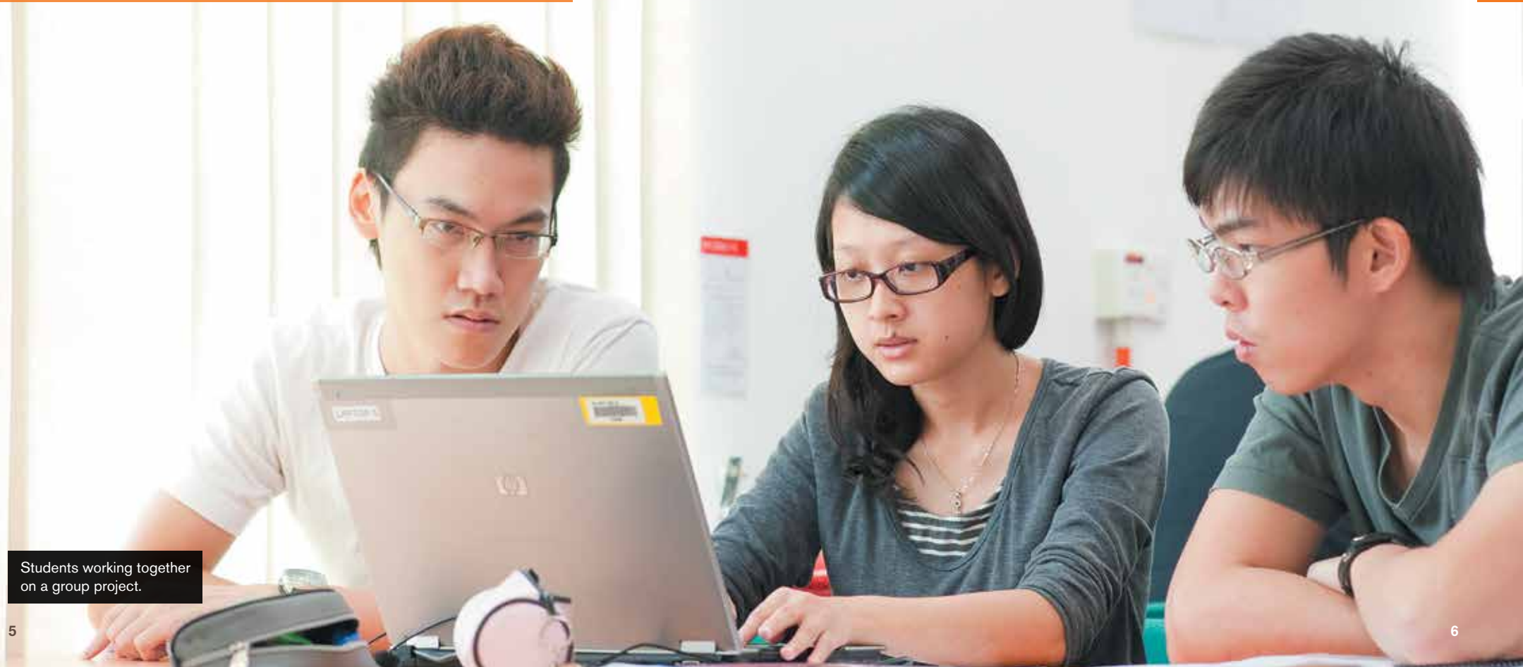
Students working together on a group project.

Now that you have your place, it's time to start getting ready to go to university. Have a read through this section and make sure you have everything prepared to make your first week as stress-free as possible.