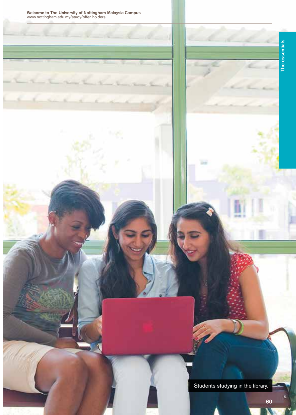
Students studying in the library.