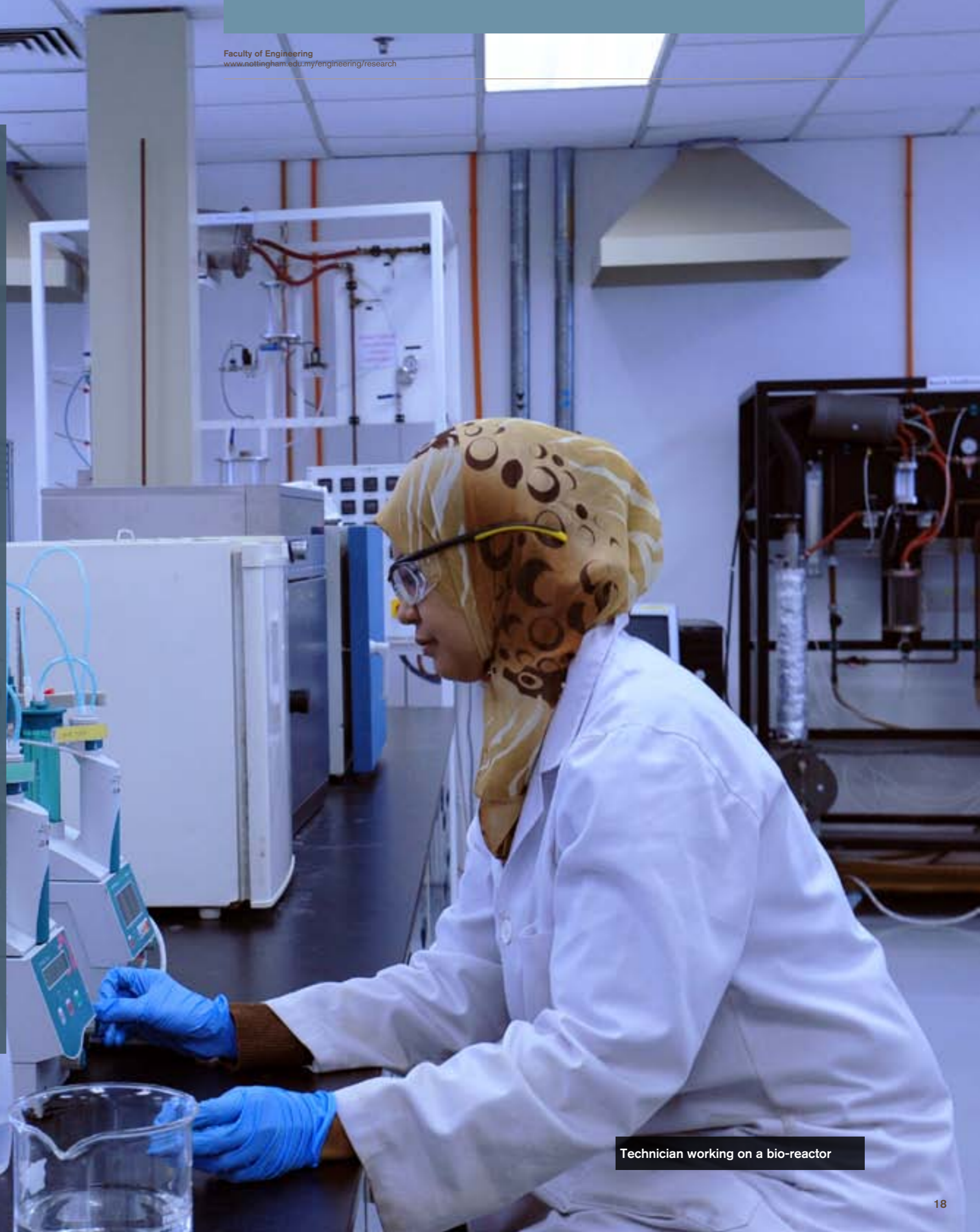
Technician working on a bio-reactor

Advanced Materials Bioengineering Geomechanics Polymer Composites System Dynamics and Integrity