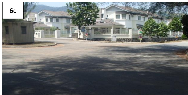
6c JALAN TTS 7 GOOGLE MAP COORDINATE Latitude: 2.954148 ; Longitude: 101.877809