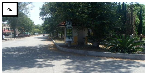
4c JALAN TTS 2 & 3 GOOGLE MAP COORDINATE Latitude: 2.947122 ; Longitude: 101.866297