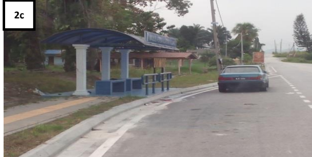
2c TIARA EAST GOOGLE MAP COORDINATE Latitude: 2.948028 ; Longitude: 101.853125