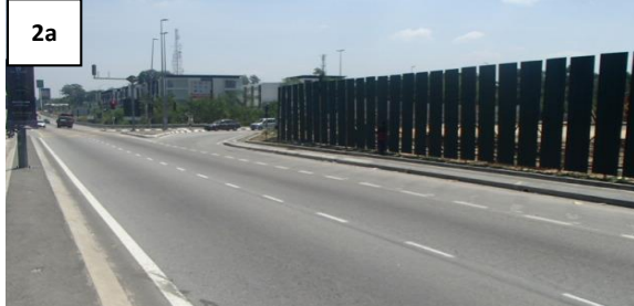
SUNWAY SEMENYIH (MAIN ROAD – 50 METRES ON THE LEFT SIDE FROM TRAFFIC LIGHT JUNCTION ) GOOGLE MAP COORDINATE