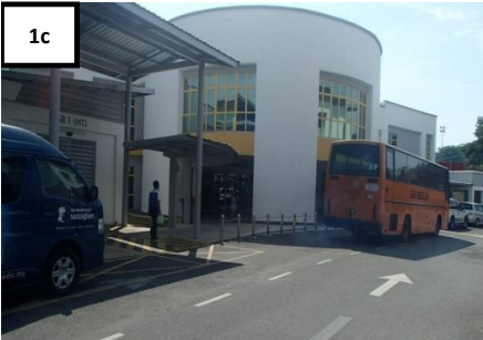
1c SA BUILDING GOOGLE MAP COORDINATE Latitude: 2.943677 ; Longitude: 101.875867