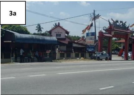
BUS STOP NEXT TO CHINESE TEMPLE GOOGLE MAP COORDINATE Latitude: 2.948857 ; Longitude: 101.846545