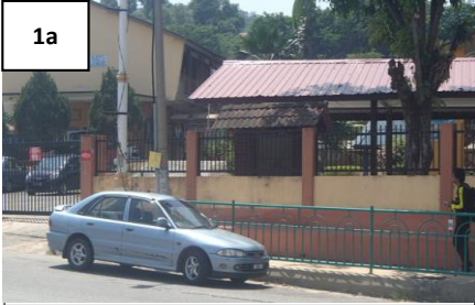
KAJANG KTM STATION GOOGLE MAP COORDINATE Latitude: 2.985568 ; Longitude: 101.791313