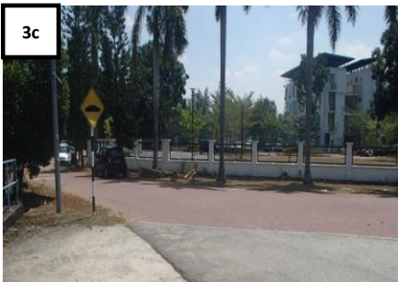
3c TETRIS APARTMENT GOOGLE MAP COORDINATE Latitude: 2.946785 ; Longitude: 101.862032