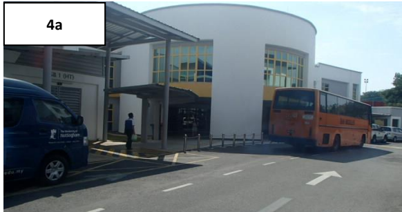
SA BUILDING GOOGLE MAP COORDINATE Latitude: 2.943677 ; Longitude: 101.875867