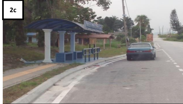
2c TIARA EAST GOOGLE MAP COORDINATE Latitude: 2.948028 ; Longitude: 101.853125