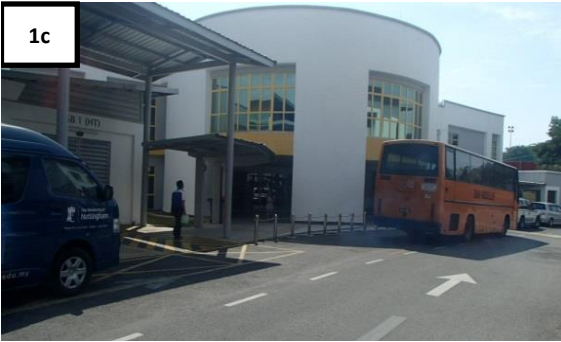
1c SA BUILDING GOOGLE MAP COORDINATE Latitude: 2.943677 ; Longitude: 101.875867