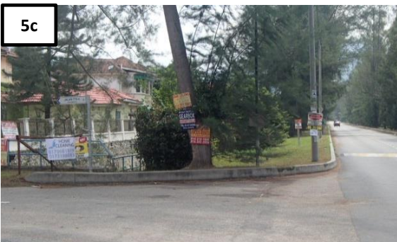
5c JALAN TTS 4 GOOGLE MAP COORDINATE Latitude: 2.949533 ; Longitude: 101.872852