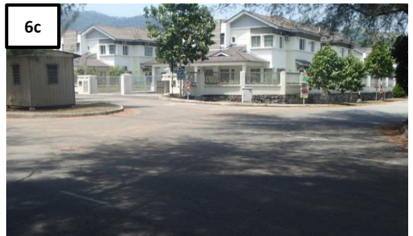
6c JALAN TTS 7 GOOGLE MAP COORDINATE Latitude: 2.954148 ; Longitude: 101.877809