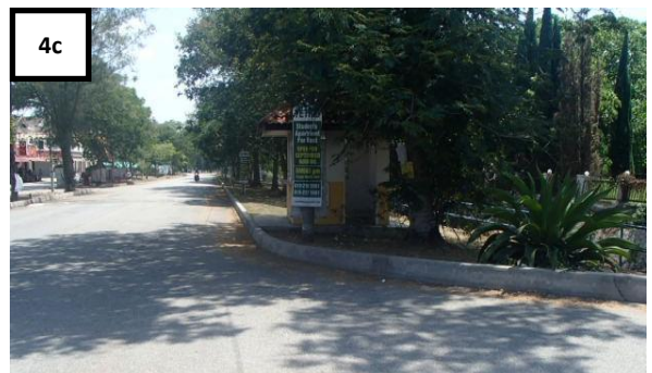
4c JALAN TTS 2 & 3 GOOGLE MAP COORDINATE Latitude: 2.947122 ; Longitude: 101.866297