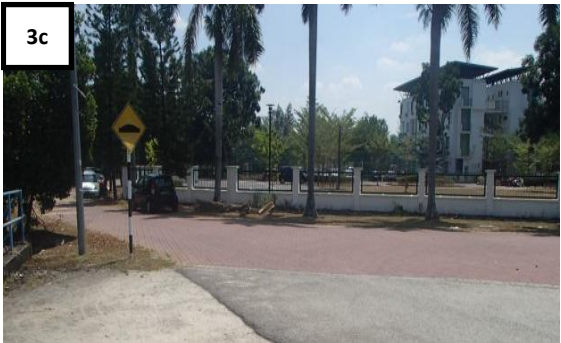
3c TETRIS APARTMENT GOOGLE MAP COORDINATE Latitude: 2.946785 ; Longitude: 101.862032