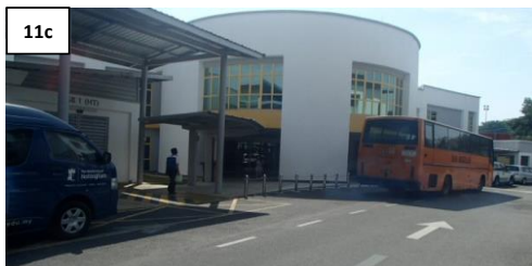
SA BUILDING GOOGLE MAP COORDINATE Latitude: 2.943677 ; Longitude: 101.875867