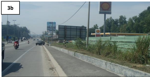
SEMENYIH TOWN (IN FRONT OF MAYBANK) GOOGLE COORDINATE MAP Latitude: 2.948225 ; Longitude: 101.846567