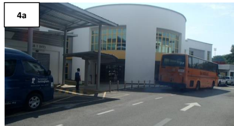
BUS STOP NEXT TO CHINESE TEMPLE GOOGLE MAP COORDINATE Latitude: 2.948857 ; Longitude: 101.846545