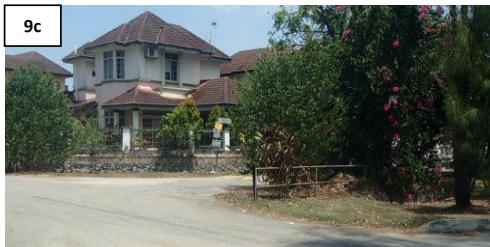
JALAN TTS 5 GOOGLE MAP COORDINATE Latitude: 2.950728 ; Longitude: 101.874483