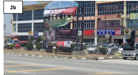
SA BUILDING GOOGLE MAP COORDINATE Latitude: 2.943677 ; Longitude: 101.875867