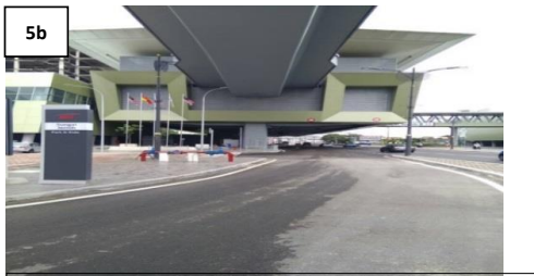
TESCO EXTRA KAJANG GOOGLE COORDINATE MAP Latitude: 3.005090 ; Longitude: 101.785463