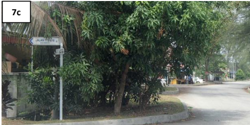
JALAN TTS 6/10 GOOGLE MAP COORDINATE Latitude: 2.95324 ; Longitude: 101.877288