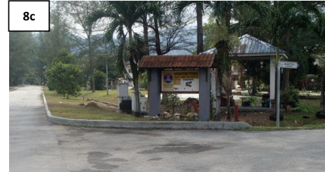
JALAN TTS 6 GOOGLE MAP COORDINATE Latitude: 2.951804 ; Longitude: 101.875684