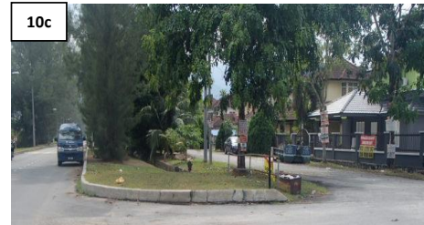
JALAN TTS 5/2 GOOGLE MAP COORDINATE Latitude: 2.949308 ; Longitude: 101.87282