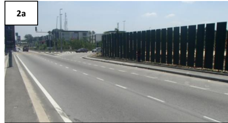
KAJANG KTM STATION GOOGLE MAP COORDINATE Latitude: 2.985568 ; Longitude: 101.791313