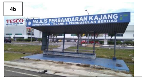
SUNWAY SEMENYIH ( SHELL STATION) GOOGLE COORDINATE MAP Latitude: 2.962711 ; Longitude: 101.836664