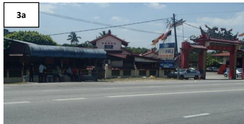
SUNWAY SEMENYIH (MAIN ROAD – 50 METRES ON THE LEFT SIDE FROM TRAFFIC LIGHT JUNCTION ) GOOGLE MAP COORDINATE Latitude: 2.960469 ; Longitude: 101.838617