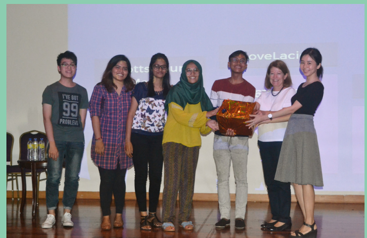
Prize giving to the winners of Quizoholic.