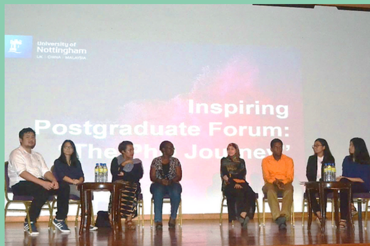
Inspiring Postgraduate Forum: "The PhD Journey"