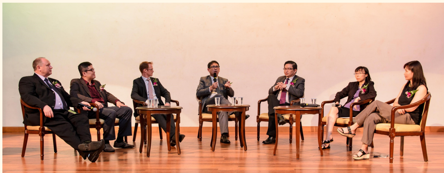
UNMC professors shared their inspirational journeys towards achieving the professorship in the forum.