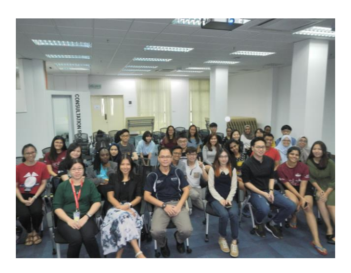
6 - Group photo of speakers and participants of Clinic for Conference Proposal and Presentation.