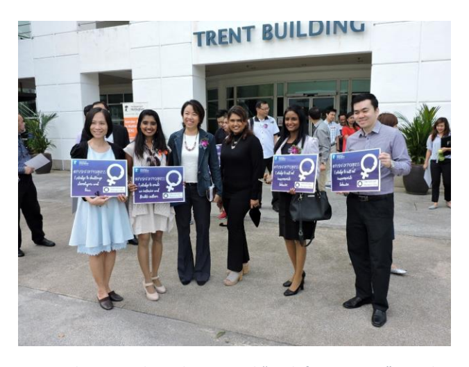
1 - Academics and speakers joined "Push for Progress" March.