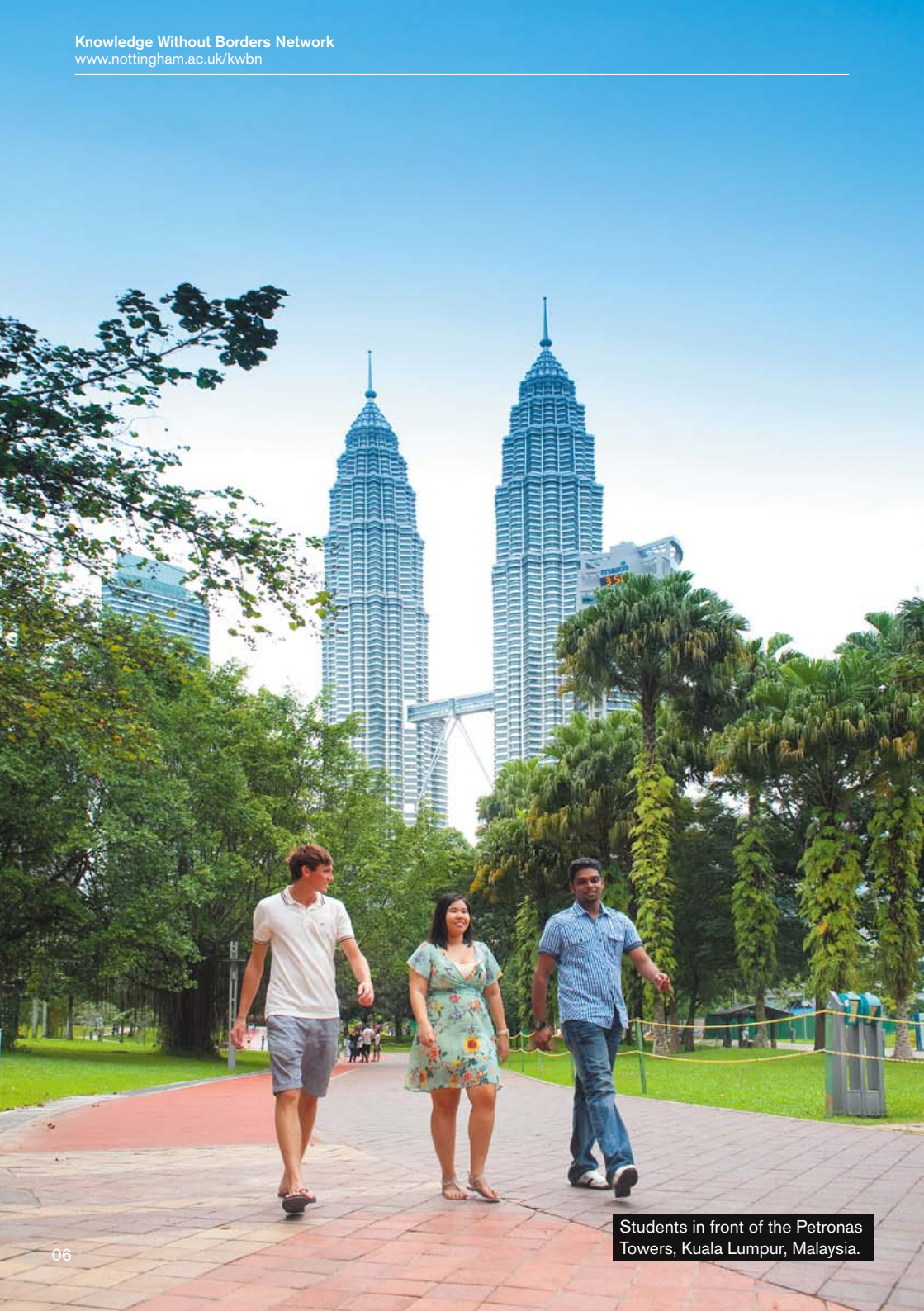
Students in front of the Petronas Towers, Kuala Lumpur, Malaysia.