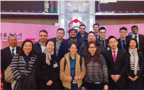
MBA study tour participants at the Shanghai Stock Exchange in January 2018

The study tour is an option available to full-time and part-time MBA students, as a separate activity from those covered by the programme's fees.